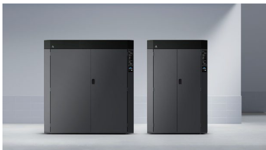
Large (DC20) and small (DC8) drying cabinets to suit fire and rescue services' requirements and space.